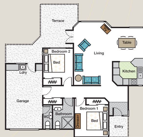
Typical 2 bedroom Villa