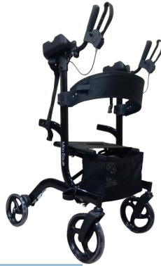
PRODUCT CODE: MEKUR