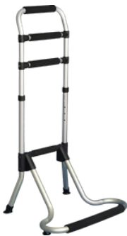
PRODUCT CODE: ASA