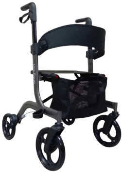
PRODUCT CODE: METR