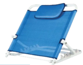
PRODUCT CODE: SBR