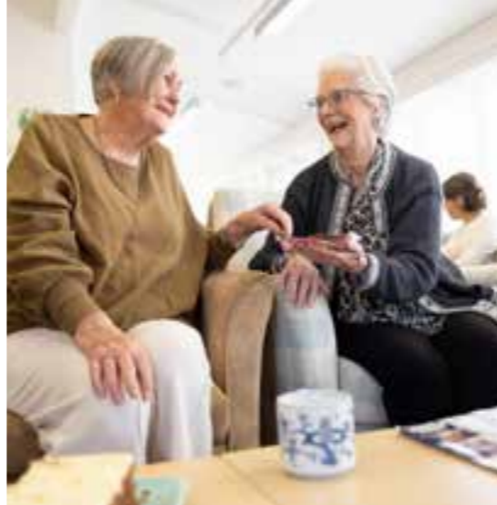
Lounge & dining area