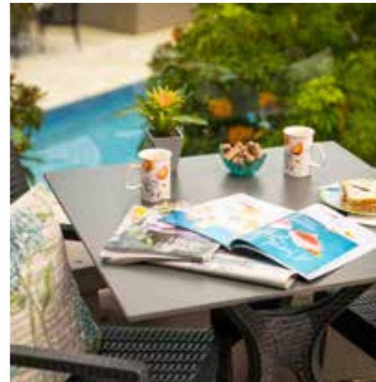
Weekly entertainment & events