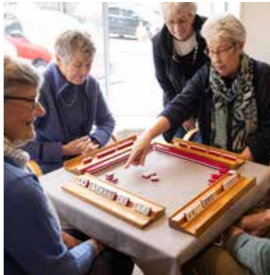
Cards, games & leisure afternoons