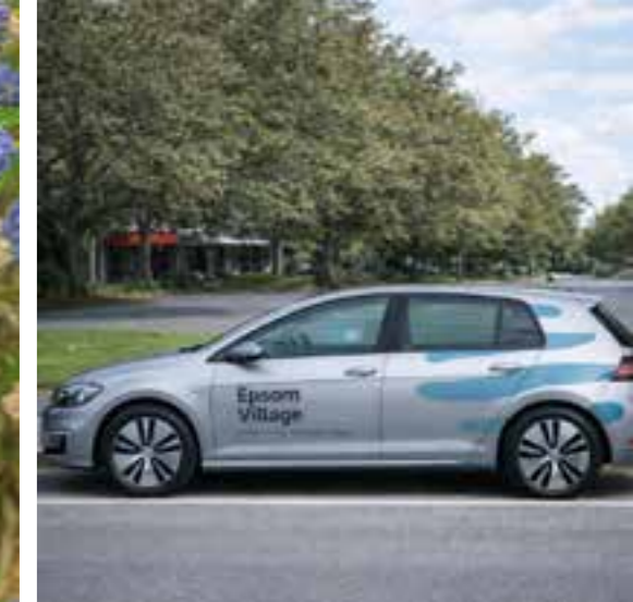
Complimentary electric car