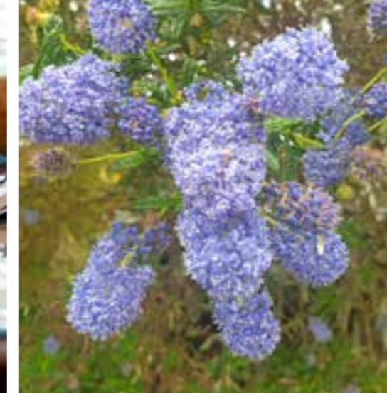
Onsite gardeners & maintenance staff