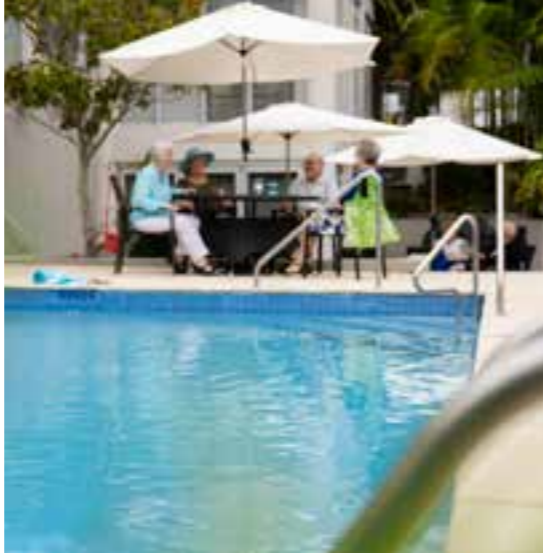
Swimming pool & barbecue area

Life here moves at your pace. Residents are free to be as involved or as independent as they choose – whether that means filling the week with activities and social events, or simply enjoying the comfort and privacy of their own space.