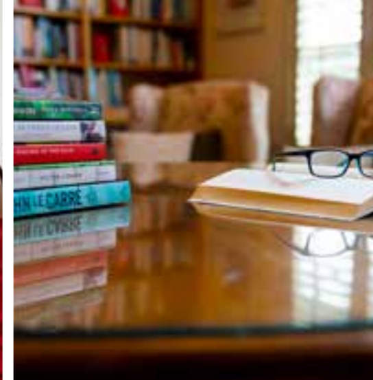
Library & book club