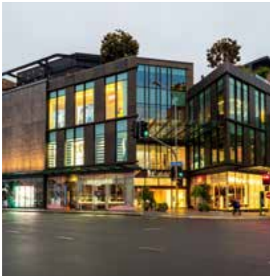
Day trips & shopping bus