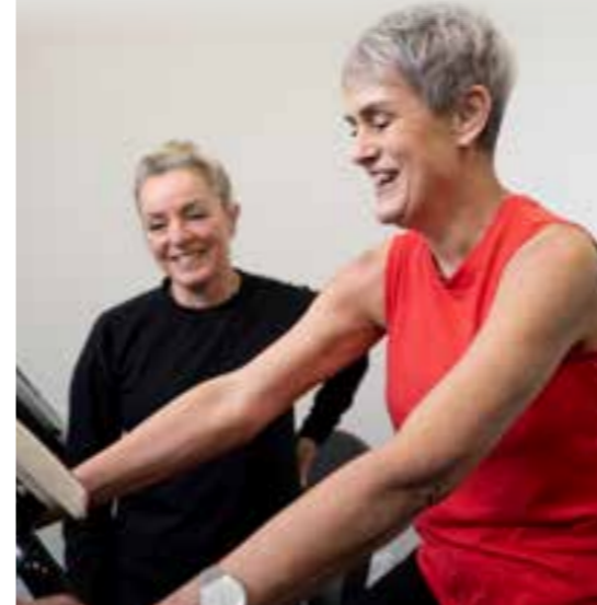
Gym & exercise groups