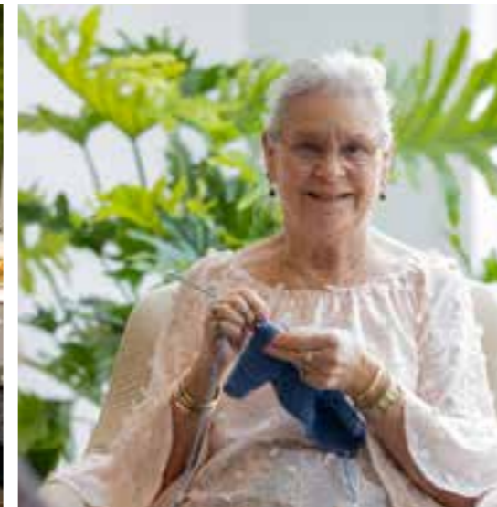
Craft groups, bingo nights & quiz group