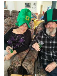
Saint Paddy's Day