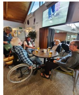
Guys trip to the club