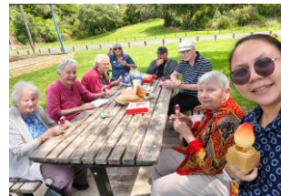
Ice Creams at the beach